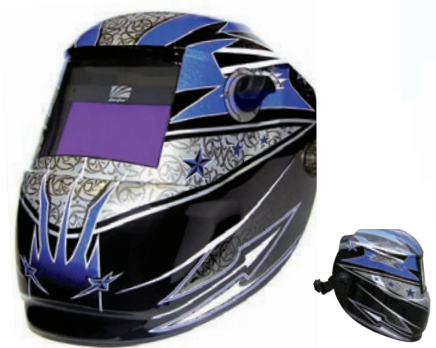
▲ ROCKSTAR (0146)