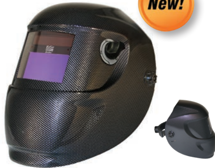
▲ CARBON FIBER (0110)