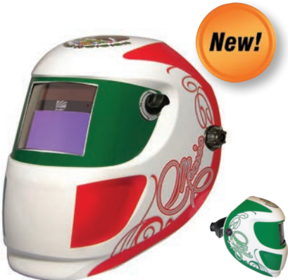
▲ MÉXICO (0151)