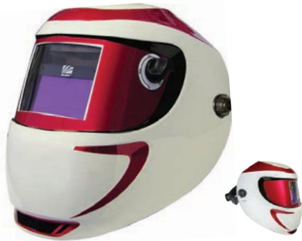
▲ 10Q (0125)