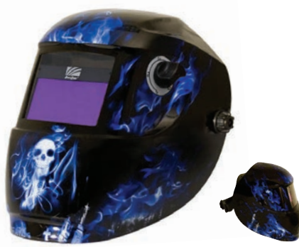
▲ BLUE DOOM (0141)