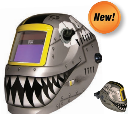
▲ FIGHTING TIGER (0171)