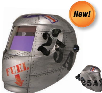
▲ TOP GUN (0166)