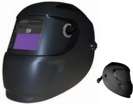
▲ BLACK (0100)