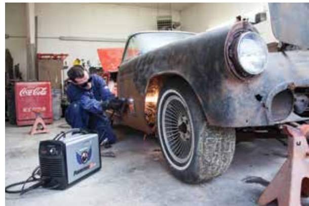
Vehicle repair and modification