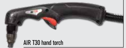
AIR T30 hand torch