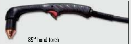
85° hand torch

(for more torch options, see www.hypertherm.com )